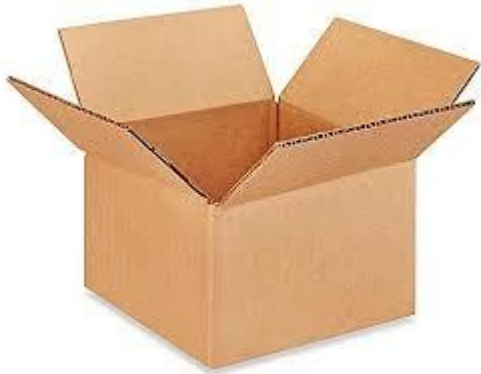
Box(es), or small inflatable pool