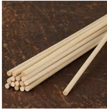
Dowel Rods, Broom Handles, or Plunger